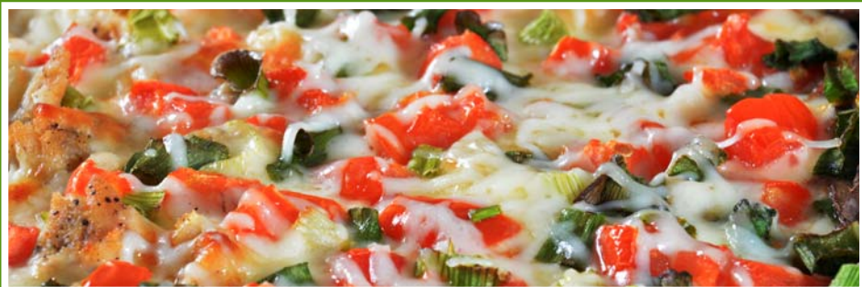
Chicken Cordon Bleu