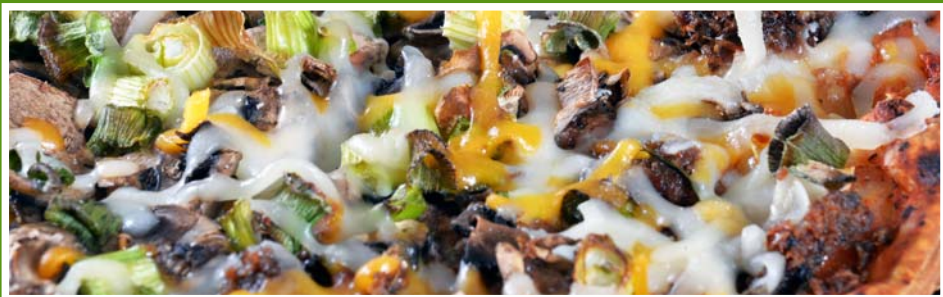
Smoked Beef Brisket